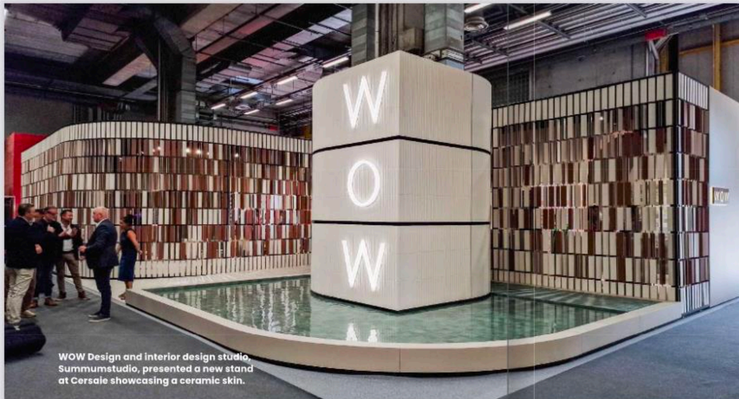
WOW Design and interior design studio, Summumstudio, presented a new stand at Cersaie showcasing a ceramic skin.